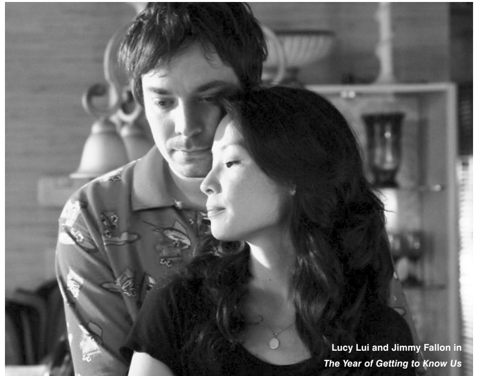
Lucy Lui and Jimmy Fallon in The Year of Getting to Know Us

6 pm. – 8 p.m. - Ceremony and Screening of "Regarde Moi" (Ain't Scared) 8 p.m. – 11 p.m. – After party at Cafe 331 featuring hor d'ouvres and music from Europa. Guest receive one complimentary Bacardi drink with their film ticket. There is no charge for this event